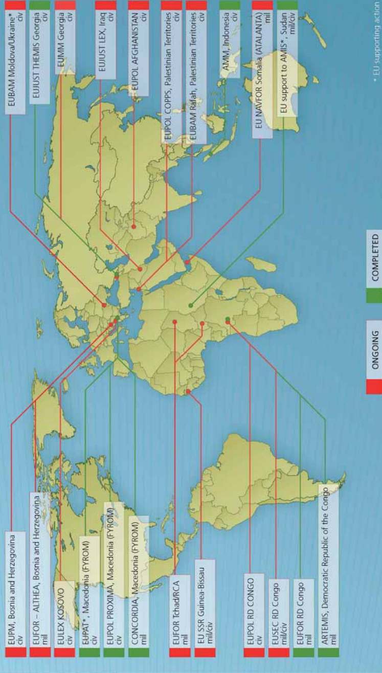
Ongoing and completed EU crisis management operations