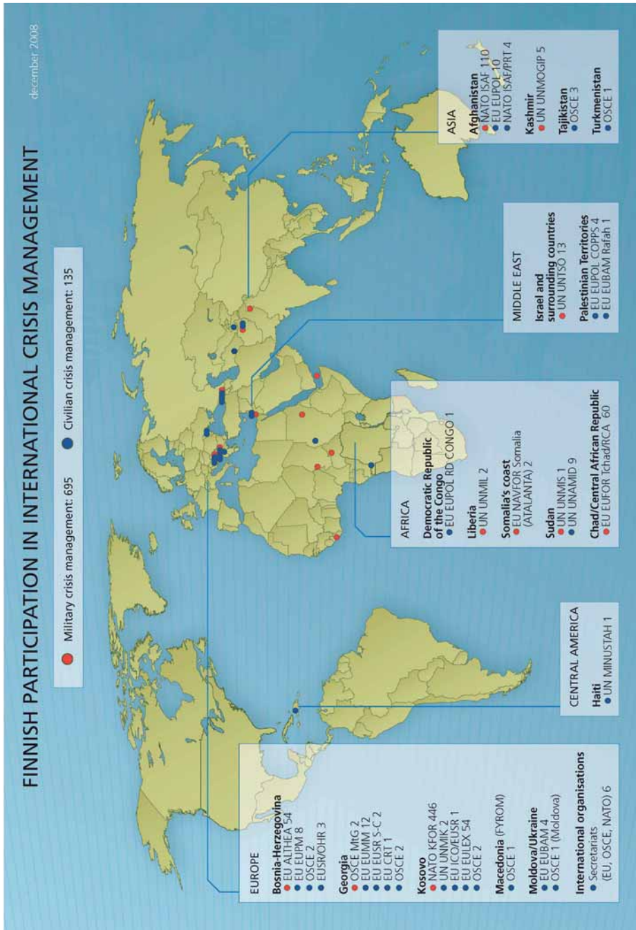
Finnish participation in international crisis management

● Military crisis management: 695 ● Civilian crisis management: 135